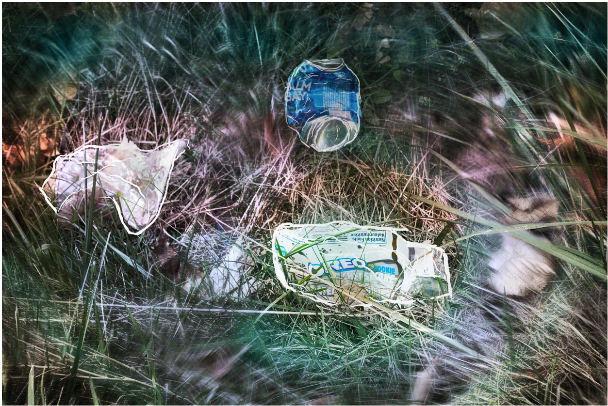
Go more experimental with filter overlays